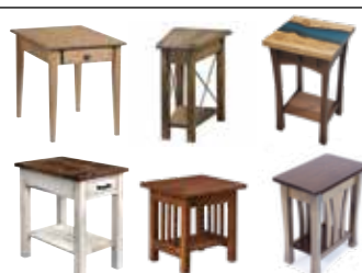
100's of Solid Hardwood Occasional Tables on Display.