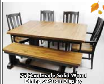
75 Handmade Solid Wood Dining Sets on Display

Come Visit Us... You'll Love The Difference