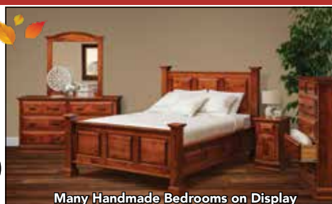
Many Handmade Bedrooms on Display