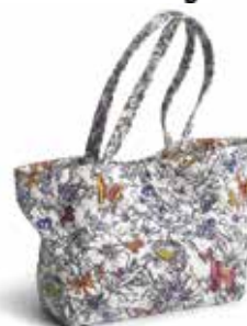
Small Hathaway Tote