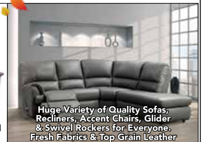
Huge Variety of Quality Sofas, Recliners, Accent Chairs, Glider & Swivel Rockers for Everyone. Fresh Fabrics & Top Grain Leather