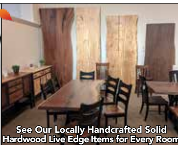
See Our Locally Handcrafted Solid Hardwood Live Edge Items for Every Room